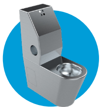
STD-E (Electronic) Electronic Piezo Flushing

Base model. This model is selected when there is an existing flushing system in place that will connect to the unit or should the client have a flushing system of their own that they wish to adapt.