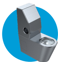
STD (Base) No Flushing

Base model. This model is selected when there is an existing flushing system in place that will connect to the unit or should the client have a flushing system of their own that they wish to adapt.