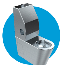
STD-M (Mechanical) Mechanical Internal Cistern

Electronic Piezo Flushing at top section of the toilet. Half flush and full flush etching is provided as well as blue rings to meet the luminance contrast. Flush capacity is configurable and are adjustable.