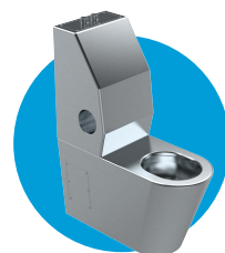
STD-FIW (Pneumatic) Separate In Wall Cistern

This unit has a mechanical internal cistern complete with AS1428 Compliant Chrome Plated Half flush/ Full flush Metal Mechanical Button(s). The cistern and all other components are housed within the confines of the unit. This unit is typically selected when a rear service void is not available.