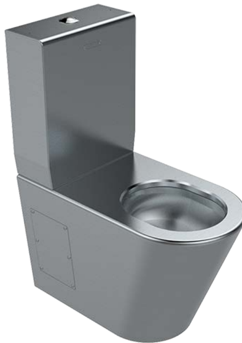
Image shows Model PTSC Britex Toilet Suite with Centurion Pan