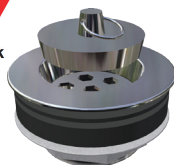
Optional Acid Resistant Grade 316 Stainless Steel Waste Outlet (LSPW)