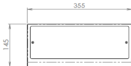
MODEL FCP Plan

When specifying this product please include: