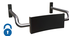
Vandal Resistant Model: Stainless Steel