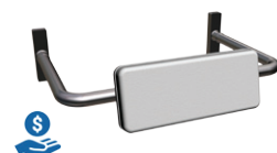
Economy Model: Polyurethane