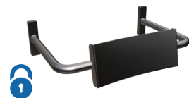
Vandal Resistant Model: Stainless Steel

Adjustable Vandal Resistant Straight Arm Backrest