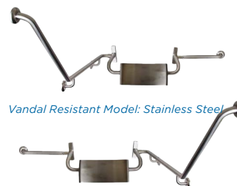
Vandal Resistant Model: Stainless Steel

Adjustable Stainless Steel Backrest with Combination Rear Rail and LHS Rail with 40 deg. extension