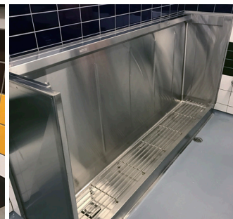
(L-R) Britex Stainless Steel Regency Urinals in 'L' shape Configuration, Britex Stainless Steel PWD Preplumbed Hand Washing Troughs complete with Vandal Resistant Wall Mounted Sink Sets in Hot and Cold configuration, Britex Stainless Steel 2600mm Long Regency Urinal.