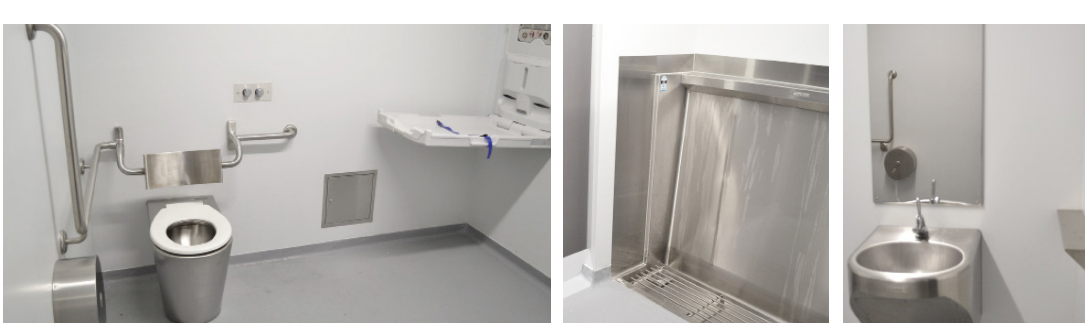
(L-R) Stainless Steel Toilet fit out including Disabled Pan with Toilet Seat, Backrest, Disabled Toilet Paper Holder, In Wall Cistern with Disabled (raised) Buttons, Sanistep Urinal complete with our Smart Sensor Flush, Disabled compliant Polished Stainless Steel Mirror, Disabled Hand Basin complete with Anti Vandal Tapware and Stainless Steel Security Shelf.