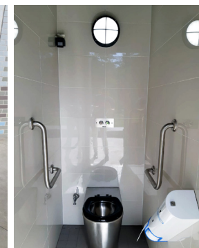
(L-R): Britex S.S. 300mm Shelf, Britex S.S. Security Mirror 1000mm x 450mm, Britex S.S. Accessible Hand Basin, Britex Timed Flow Pillar Lever Tap, Britex S.S. Centurion Child Pan supplied with Navy Child Toilet Seat, Britex S.S. 300mm Shelf, Britex S.S. Security Mirror 1000mm x 450mm, Britex S.S. Accessible Hand Basin, Britex Timed Flow Pillar Lever Tap, Multiple Britex Deluxe Timed Flow Push Button Pillar Taps, Britex S.S. Centurion Ambulant Toilet Pan, Britex S.S. In Wall Cistern with Raised Accessible Buttons and Multiple Britex S.S. 90 Degree Ambulant Grab Rails.