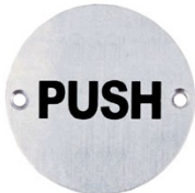
BTX-02-015 Push Indication S.S.