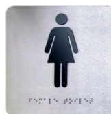
BTX-02-023 Ladies Braille Sign S.S.