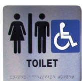
BTX-02-021 Unisex Braille Sign S.S.