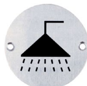
BTX-02-020 Shower Indication S.S.