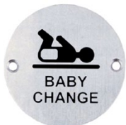
BTX-02-017 Baby Change Indication S.S.