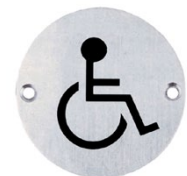
BTX-02-018 For Handicapped S.S.