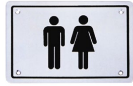
BTX-02-012 Public Washroom S.S.

(rectangular type sign plate) SIZE 245 x 145 x 1.5mmT