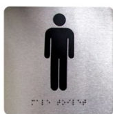
BTX-02-024 Men's Braille Sign S.S.