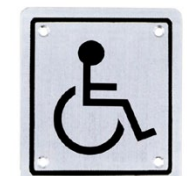
BTX-02-019 For Handicapped S.S.