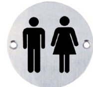
BTX-02-027 Public Washroom S.S.