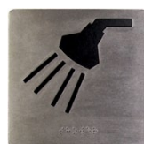
BTX-02-026 Shower Braille Sign S.S.