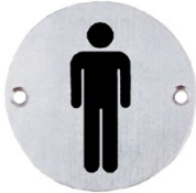
BTX-02-013 Men's Washroom S.S.

(rectangular type sign plate) SIZE 245 x 145 x 1.5mmT