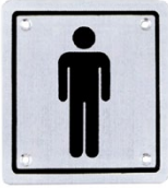
BTX-02-010 Men's Washroom S.S.