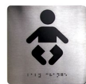
BTX-02-025 Baby Change Braille Sign S.S.