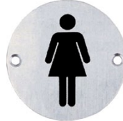
BTX-02-014 Ladies Washroom S.S.