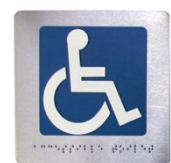
BTX-02-022 Handicap Braille Sign S.S.