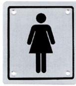
BTX-02-011 Ladies Washroom S.S.